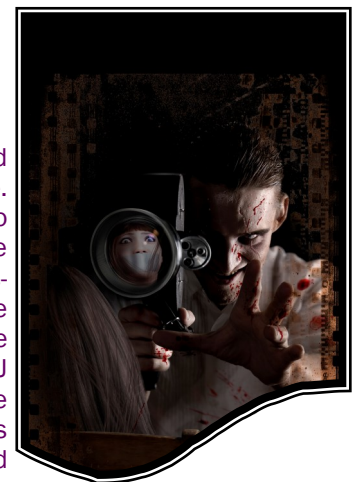
Beware of The Director who is filming his latest gruesome movie