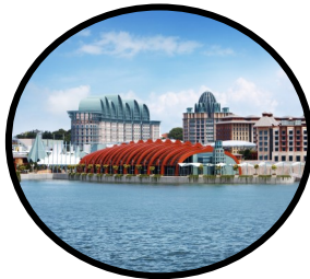
Housed in an iconic steel and glass ship hull

Aquarium. Coming to Sentosa on 15th Oct 2011, this museum offers exciting and immersive experiences; some of the key attractions are The Mighty Bao Chuan, The Jewel of Muscat, and Typhoon Theatre.