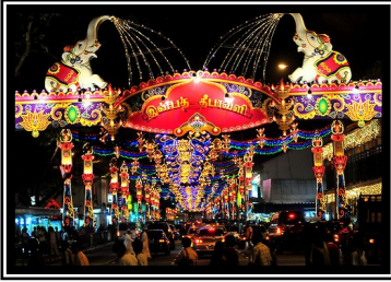
Celebration of good or light victory over evil or darkness