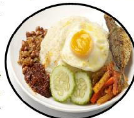
Aromatic blend of spices in Nasi Lemak

with rice. Visit any Malay restaurants to savour Soto Ayam, a spiced chicken stock served with chicken and bean sprouts, together with your choice of a potato croquette or compressed rice cakes. Enjoy Skewers of beef, lamb or chicken Satay served with onions, cucumbers and the ubiquitous peanut sauce. Pick Nasi Lemak, packed in a banana leaf and Beef Rendang, a hearty dish made of large chunks of beef cooked with spices and herbs at a Malay stall at any food centre. Meanwhile, Cendol, one famous type of Malay desserts, is very rich in coconut milk, while Ice Kachang, another signature dessert, is made of flavoured ice with red bean and jelly.