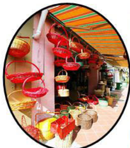
Shops selling woven basket at Arab Street

Discover a rich Malay cultural conservation area, Kampong Glam, where it became the golden ethnic enclave once Malay royalty started its history in Singapore. Begin your walking trail of Kampong Glam at the Malay Heritage Centre (also known as Taman Warisan Melayu) at 85 Sultan Gate. The heritage centre also includes the Malay Heritage Museum, which aims to preserve and showcase the culture and heritage of the Singaporean Malays through artifacts and diorama displays.