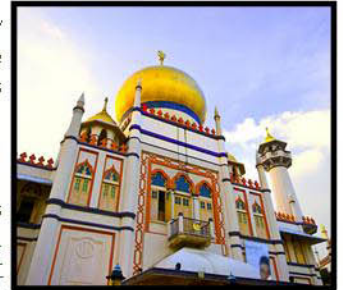
Masjid Sultan as one of the mosques where celebration is held

Hari Raya Haji, or the "Festival of Sacrifice", is celebrated by Muslims all over the world in three days period. According to Hijrah, the Islamic calendar, this festival starts on the 10th day of the month of Dhul Hijja, which is 70 days after the holy month of Ramadan. This celebration is to mark the end of Hajj, the annual holy pilgrimage to Mecca. Thousands of pilgrims simultaneously converge on the Holy land to perform a series of rituals. The Hajj is also considered as the fifth pillar of Islam, a religious obligation for able-bodied Muslims with the financial means.