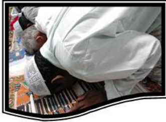
Male volunteers offer their Hari Raya Haji prayers

Hari Raya Haji, or the "Festival of Sacrifice", is celebrated by Muslims all over the world in three days period. According to Hijrah, the Islamic calendar, this festival starts on the 10th day of the month of Dhul Hijja, which is 70 days after the holy month of Ramadan. This celebration is to mark the end of Hajj, the annual holy pilgrimage to Mecca. Thousands of pilgrims simultaneously converge on the Holy land to perform a series of rituals. The Hajj is also considered as the fifth pillar of Islam, a religious obligation for able-bodied Muslims with the financial means.