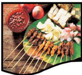
Satay, one of Malay signature dishes

Malay cuisine is well-known for its aromatic blend of spices and herbs including the kaffir lime leaf, lemongrass, shallots, garlic, ginger, galangal, curry leaves, turmeric, pungent belachan (shrimp paste), and chillies. Most of the dishes also use coconut milk to take the edge off the spicy curries and to garnish cakes and other types of desserts. Furthermore, the dishes do not include any pork for religious reasons and they are generally referred to as "halal".